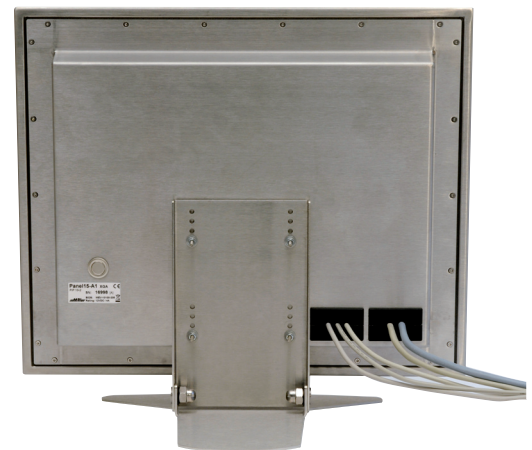
View from back with IP65 cable openings