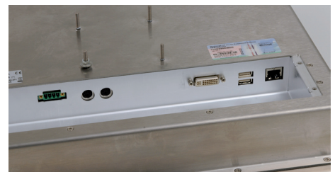
Access to direct board interfaces which can be covered with a plate