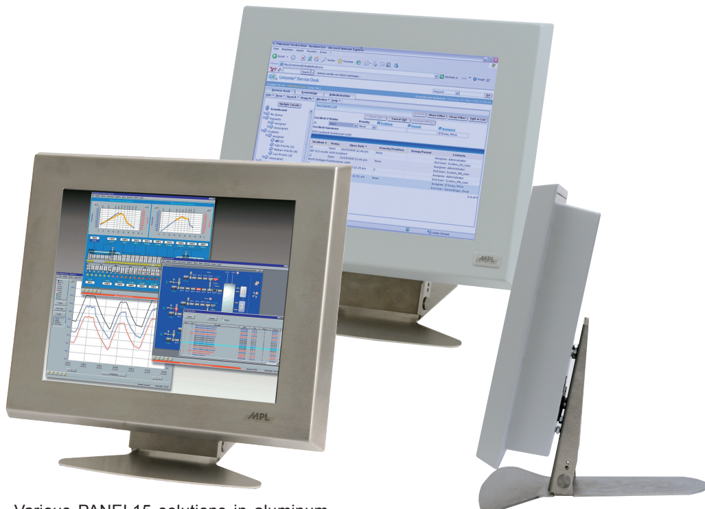
Various PANEL15 solutions in aluminum and stainless steel

The robust and all around IP65 protected PANEL15 is the perfect solution as man machine/front end interface for harsh applications like in transportation, maritime or for clean environments like in medicine, food industry. Further as space saving, IP54 protected, fanless and noiseless system the PANEL15 is the solution for desktop applications in telecommunication, kiosk information systems and Internet access points.